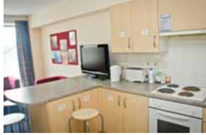
Well-equipped shared kitchen