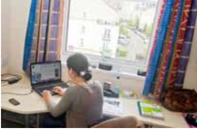
Spacious student bedroom