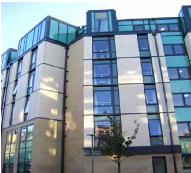
McDonald Road Apartments

The local area offers an excellent selection of shops, restaurants, nightlife and leisure facilities. McDonald Road is also within an easy 25 minute walk from the college, or 15 minutes by bus.