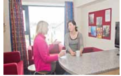
Shared living area