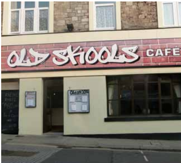
Old Skool's Residence

Old Skool's consists of 15 nicely decorated rooms. There are single, twin or multi-bedded rooms available with shared bathroom and toilet facilities. The residence can offer a catered option and self catering facilities are available for those who prefer this option.