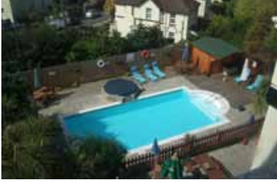
Sun terrace and heated swimming pool