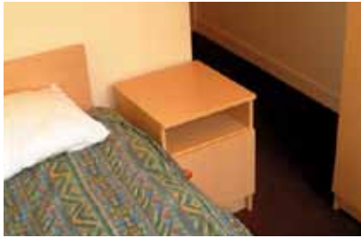
Single study bedroom