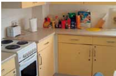
Fully equipped shared kitchen