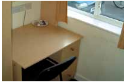
Each room includes a desk and chair for studying