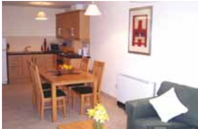
Kitchen and dining room