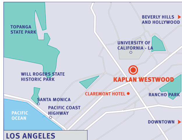
Location of Kaplan's Westwood Center and the Claremont Hotel

Claremont Hotel 1044 Tiverton Avenue Los Angeles CA 90024 USA