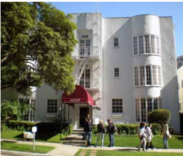
Claremont Hotel residence

The Claremont Hotel offers single rooms each with private bathroom facilities. Additional amenities include a common lobby/TV room, as well as a coffee room where students can enjoy complimentary tea or fresh coffee. From the property, students can easily walk to the UCLA campus. Nearby public transit provides students with access to Santa Monica, Beverly Hills, Hollywood and Universal Studios.