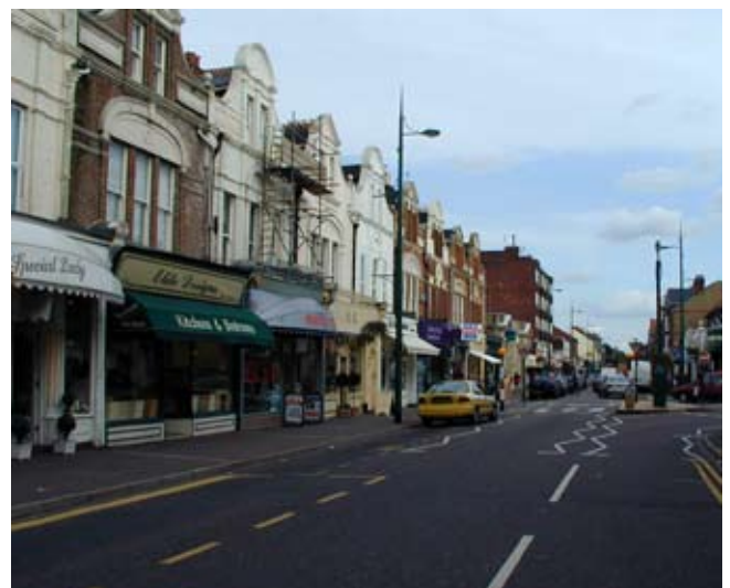
The seaside town of Bournemouth

Bank Apartment 129 Poole Road Westbourne Bournemouth BH4 9BG United Kingdom