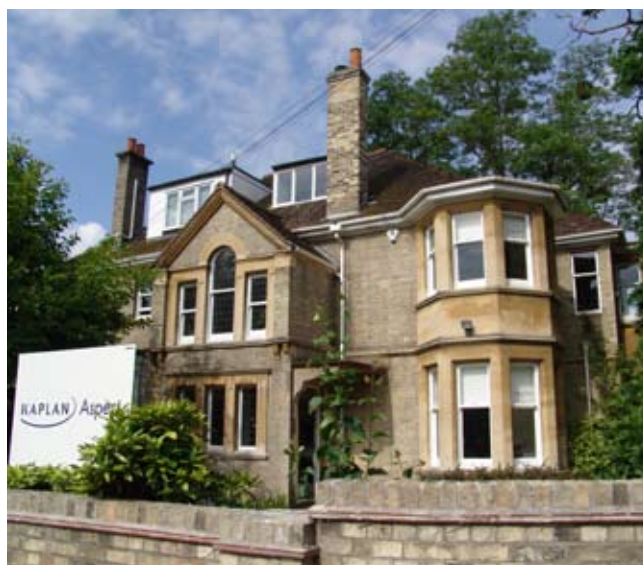
Kaplan Aspect Cambridge

Founded in the late 1970s, Kaplan Aspect Cambridge is housed in a large, converted Edwardian house with a modern extension. The school is west of the city centre in the quiet, residential area of Newnham, a 10-minute bus ride away from the centre. The school has its own gardens where we hold barbecues on warm summer evenings.