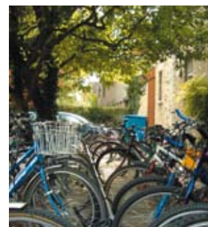
Bikes outside the school