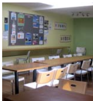
School coffee shop