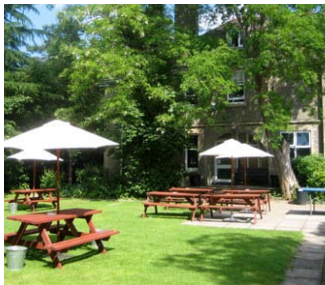
Picnic benches in the school garden

Trains to Cambridge depart from London Kings Cross station and London Liverpool Street every 30 minutes from 06.00 - 23.00. Journey time: 50 minutes.