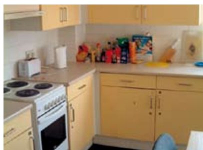
Fully equipped shared kitchen