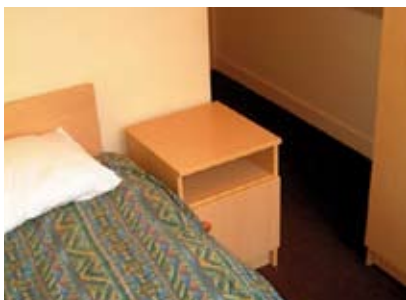
Single study bedroom