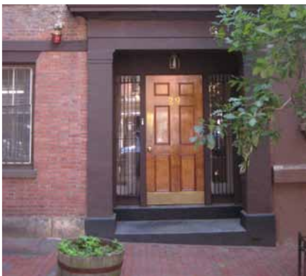
Beacon Hill Apartments - Exterior

The Boston Kaplan International Center is 10 minutes away on foot and the residence is within easy access of all subway lines. The apartments are located approximately 20-30 minutes by subway from the Kaplan Northeastern Center and the Kaplan Harvard Square Center.