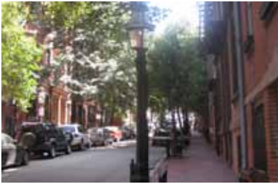
Beacon Hill street view