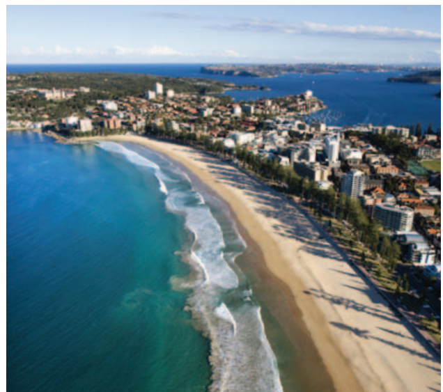
Manly Beach and Sydney city centre in the distance