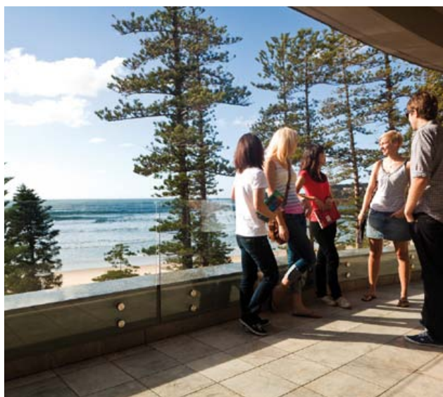
Kaplan International College Sydney Manly

Other facilities include a multimedia library where students can access a variety of online and audio-visual resources, a spacious student lounge leading on to the large balcony and of course step outside the door and you are on the beach!