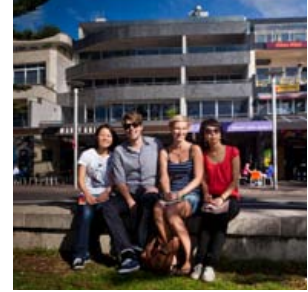
Kaplan International College students at the front of the college