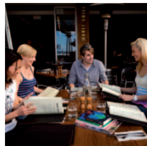
Cafés and restaurants