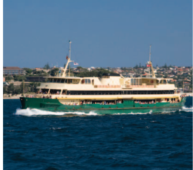
Manly Wharf Ferry Terminal

From the Domestic Terminal a one way train ticket will cost AUD 14.60 or AUD 15.20 from the International Terminal to Circular Quay, Town Hall or Central Station, where you can catch a connecting bus, train or ferry. Journey time is approximately 30 minutes.