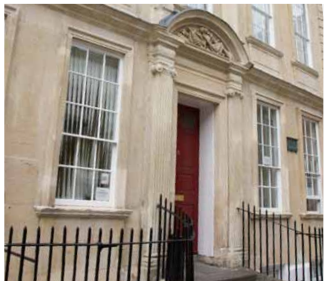
Kaplan International College Bath

Our Bath college is based in comfortable historical buildings right in the heart of the city, less than one minute's walk away from shops, cafés and restaurants. Pleasantly furnished classrooms are complemented by a computer centre and library, together with a common room where students can relax over a cup of tea or coffee. A tranquil courtyard garden offers a sanctuary in which to work or socialise outside.