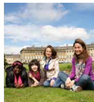
The Royal Crescent