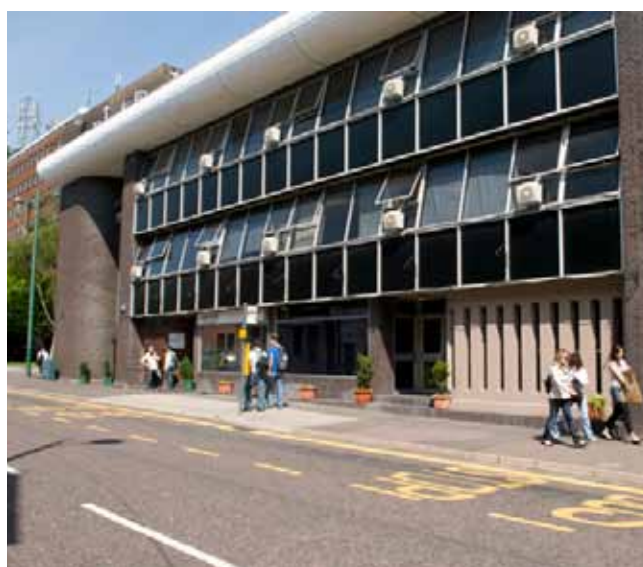
Kaplan International College Bournemouth

The college was built in the 1960s. It is a modern building with three floors and is situated in the area of Westbourne, roughly 5 minutes by bus from Bournemouth town centre. The college is located on a main street and has a lovely patio at the back.