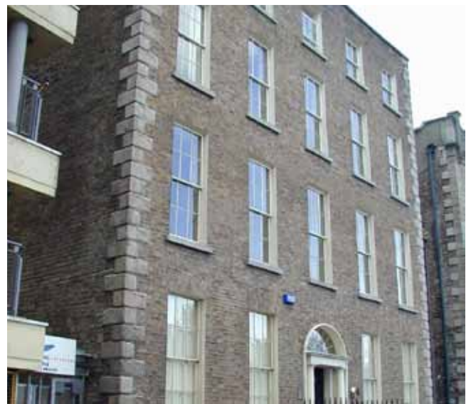
Kaplan International College Dublin

The college is housed in a magnificent Georgian building overlooking the River Liffey. Excellent facilities include a large student common room with new flat-screen computers for personal use, a self-study room, a dedicated study room and free wireless Internet access.