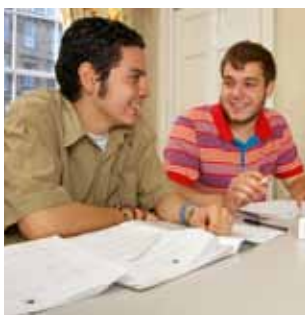
Kaplan students in a classroom

A full and varied social programme is organised each week. Please see overleaf for an example timetable.