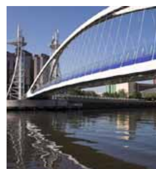
Bridge at Salford Quays