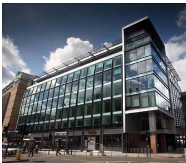
Kaplan International College Manchester

The college is centrally located on Portland Street, within walking distance of a variety of restaurants, bars and theatres. Facilities include large, well-equipped classrooms, a multimedia centre and a student common room with internet access.