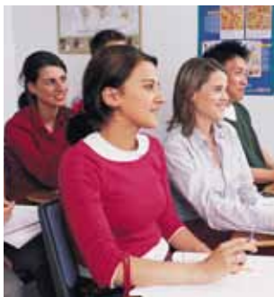
Kaplan students in the classroom

Our full time social organiser helps ensure that students get as much out of their stay in Oxford as possible. We always ask our students to let us know what activities they are interested in to plan the programmes you want!