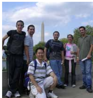
Enjoy your time at Kaplan!

Beach trips, walking tours of Portland, Trailblazers basketball games, hiking, and skiing are just some of the great activities you can enjoy. These activities are led by a member of the Kaplan staff and will help you to meet new people and discover the city of Portland as well as other parts of the Pacific Northwest.