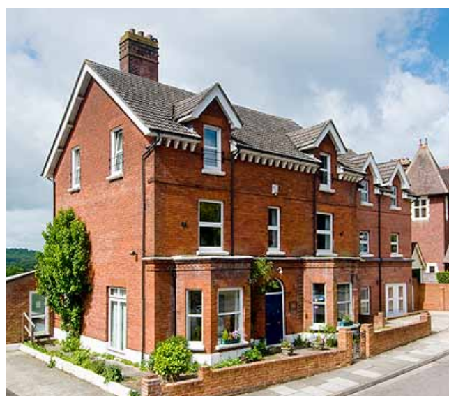
Kaplan International College Salisbury

Kaplan International College Salisbury is a member of ENGLISH UK.