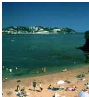
One of Torquay's eighteen beaches