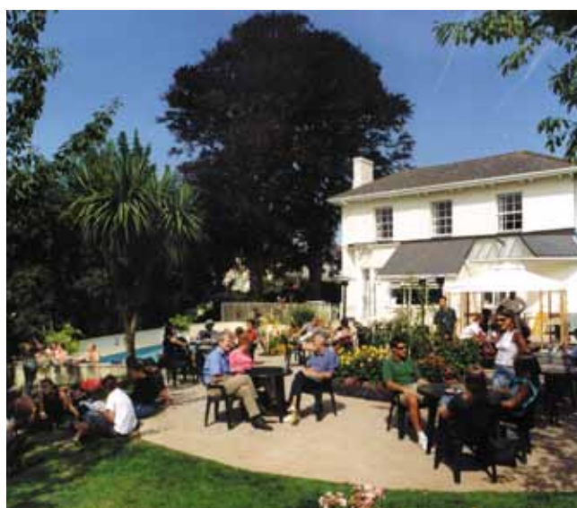
Kaplan International College Torquay

Kaplan International College Torquay is a member of ENGLISH UK