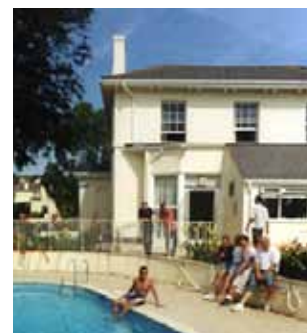
Patio and pool