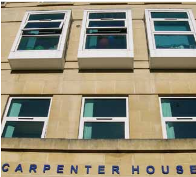
Carpenter House Residence

Rooms are comfortable, spacious and light. Bed, mattress, desk, chair, wardrobe/hanging space, drawers, waste paper bin, mirror and pin-board are provided in each room.