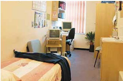
Single bedroom with study facilities