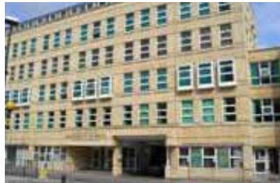
Carpenter House Residence