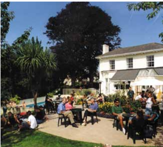
Kaplan International College Torquay

Our college is just three minutes' walk from the centre of town, enabling you to sample everything on offer locally. Inside you will find comfortably furnished classrooms, a computer centre, library and listening centre, as well as a student common room with giant screen TV, video and DVD. There is also a cafeteria serving hot and cold lunches daily, so when the weather is fine, as it often is in Torquay, you can eat outside in the lush gardens overlooking the town, or why not take a plunge in the college's very own swimming pool!