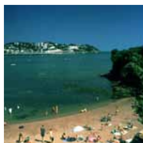
One of Torquay's eighteen beaches