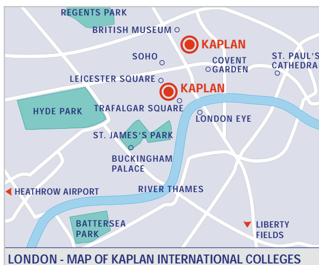
LONDON - MAP OF KAPLAN INTERNATIONAL COLLEGES

Students staying at Liberty Fields are assured of a high-quality, comfortable living environment, and can at the same time enjoy all that London has to offer.