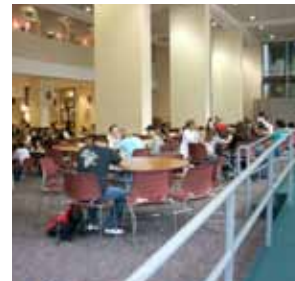
Students at Northeastern