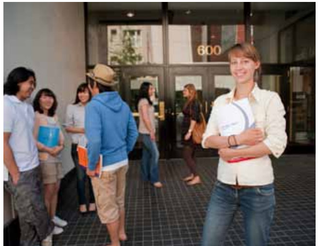
Kaplan Center Entrance

Details may change. Published Aug. 2010.