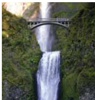
Enjoy the beautiful scenery in Oregon

Public telephones can be found throughout the downtown area and wireless internet is widely available. Computer stations can be used at the nearby public library.