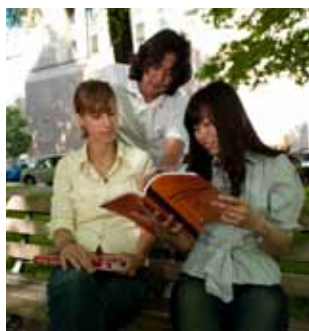
Study in a sociable atmosphere