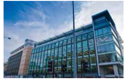
The college - just 10 minutes from the residence